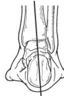
Normal foot (rear view)